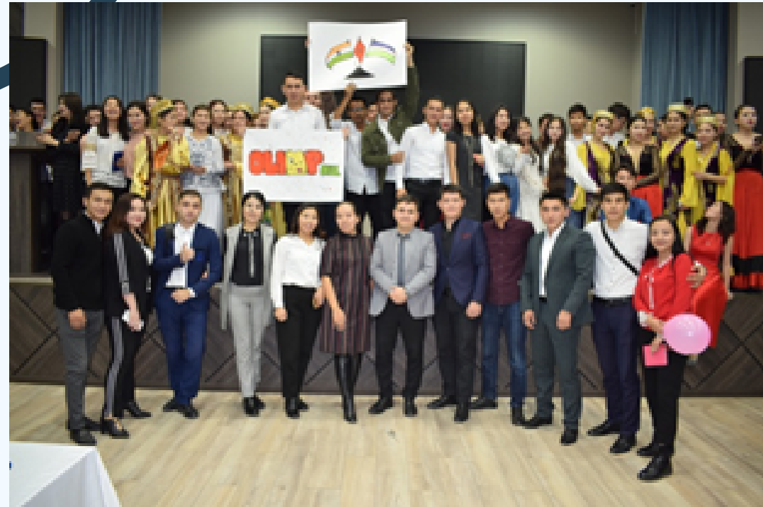
Foreign students at the "New Wave" competition