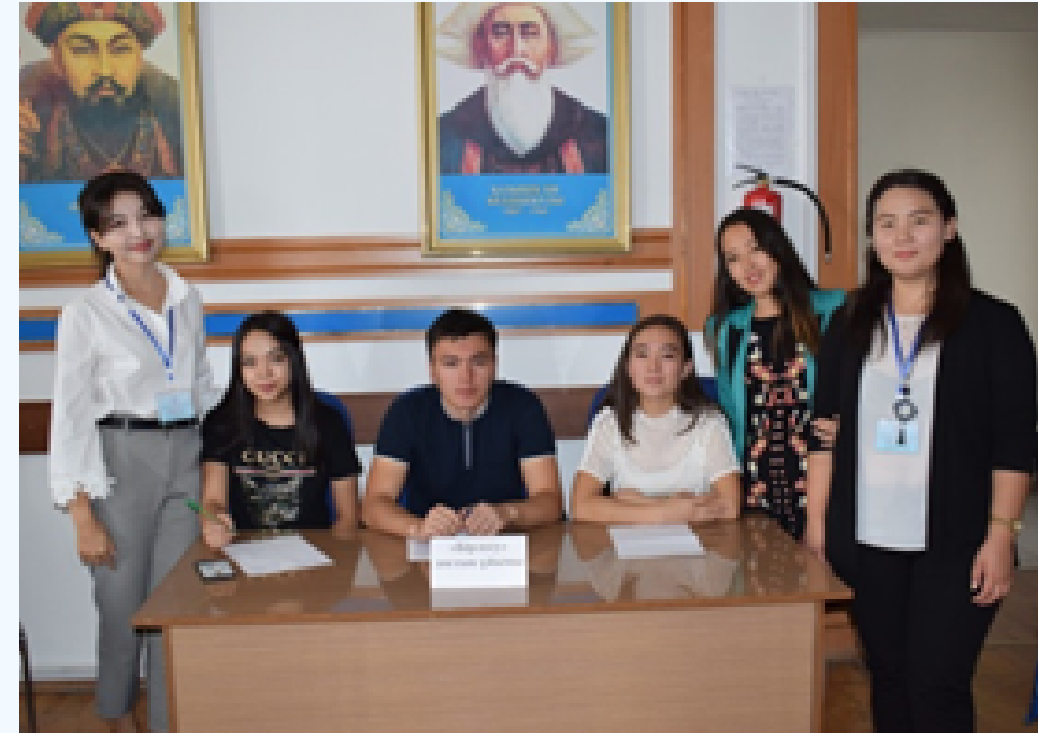
Collection and registration of members in the friendly organization "Birlesu"