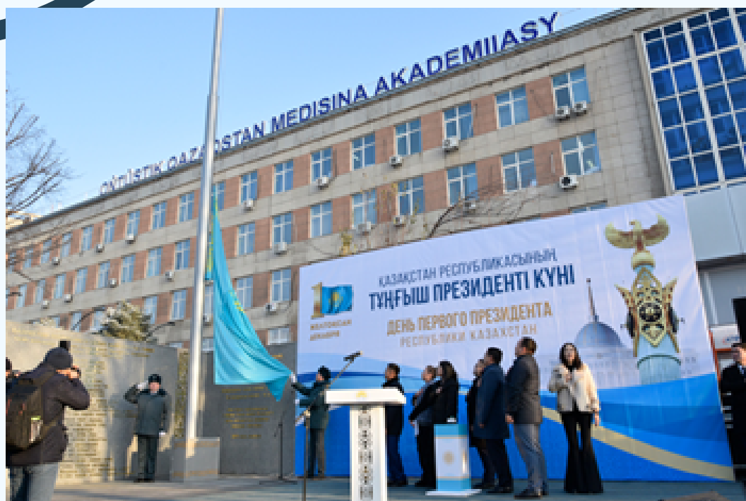
Patriotic action dedicated to the Day of the First President of the Republic of Kazakhstan