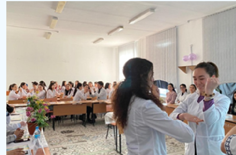
A training seminar was held on the topic "Psychological and preventive measures"