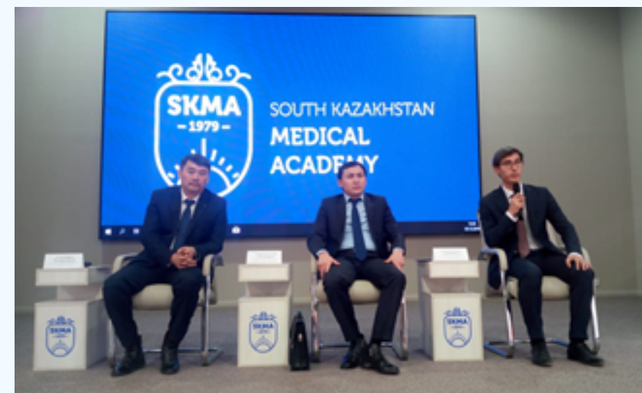
Meeting with the staff of the Project Office "Square of Honesty"