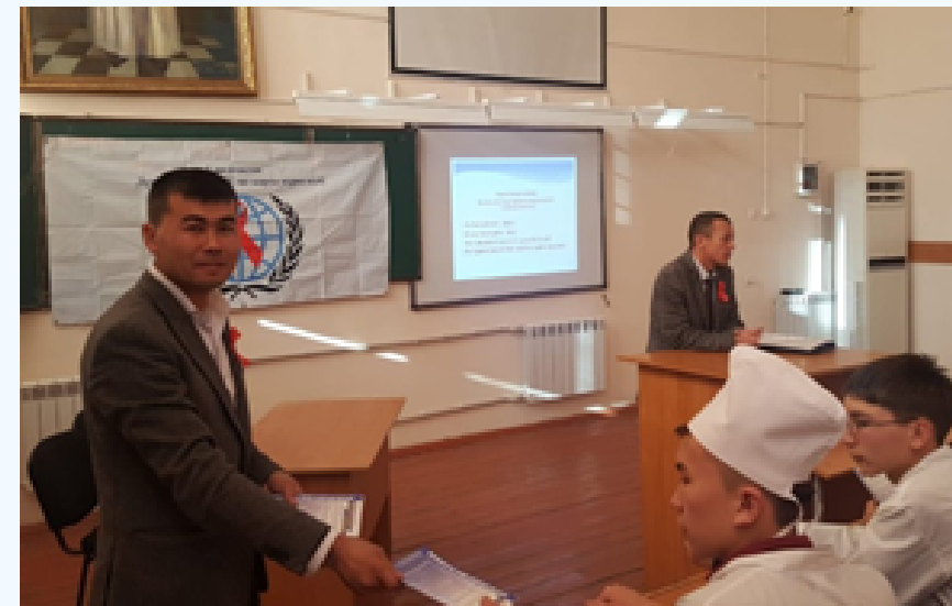
Meeting with the staff of the Speed Center on the occasion of "December 1 - AIDS Day"