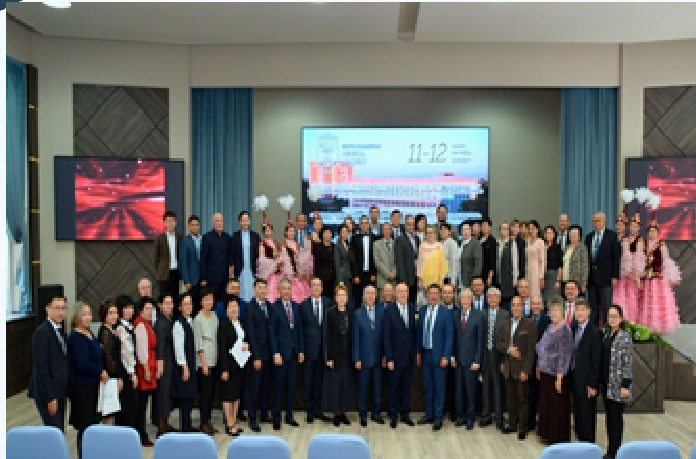
A museum was opened for the 40th anniversary of SKMA, a conference was organized