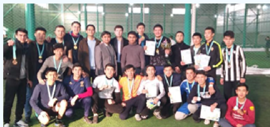
A football competition was held among organizations