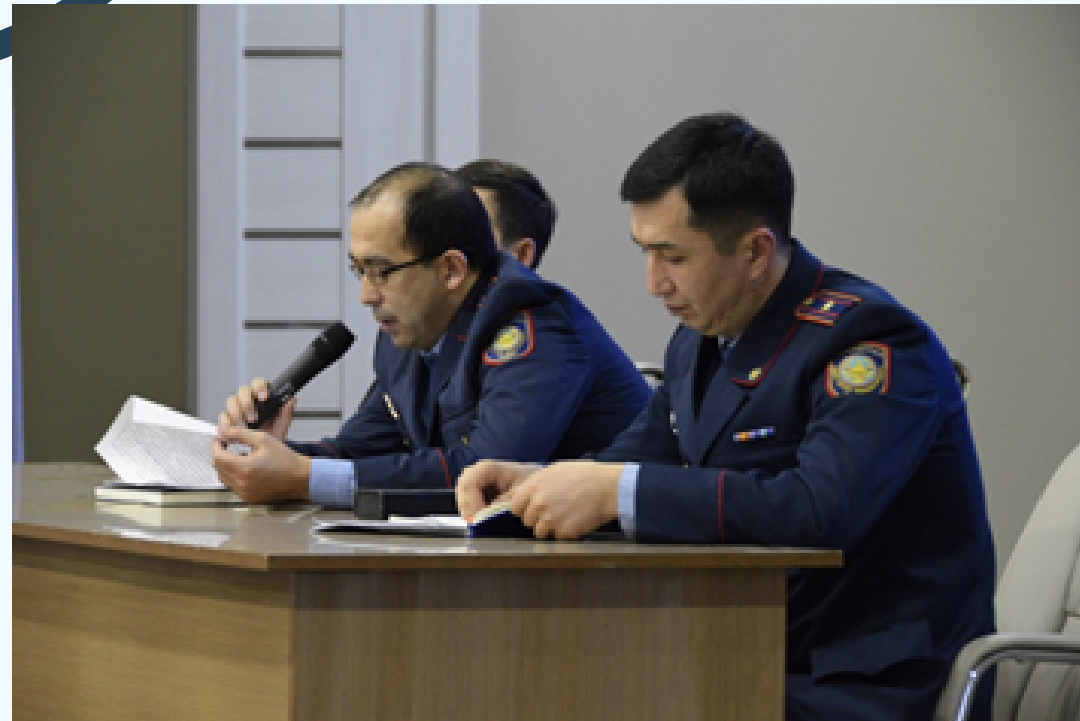
A meeting was held with the participation of representatives of law enforcement agencies