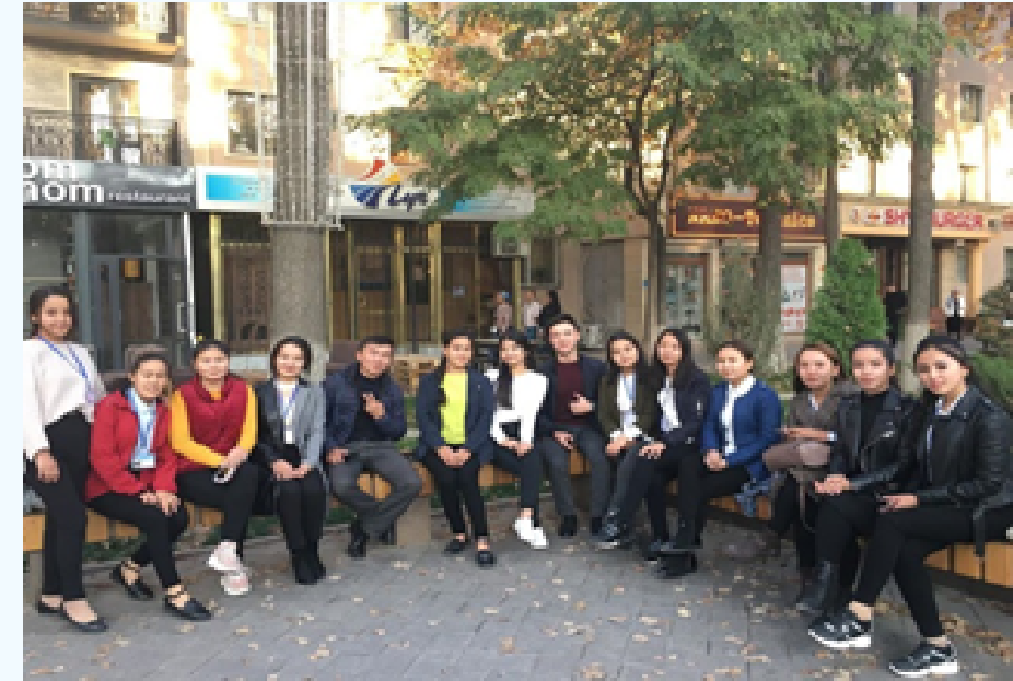
On the occasion of "November 17 - International Students Day" held a friendly meeting on reading poetry in the recreation area "Arbat"