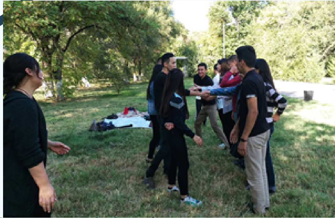
“Meeting of the friendly organization” Birlesu “in the park” Abay ”