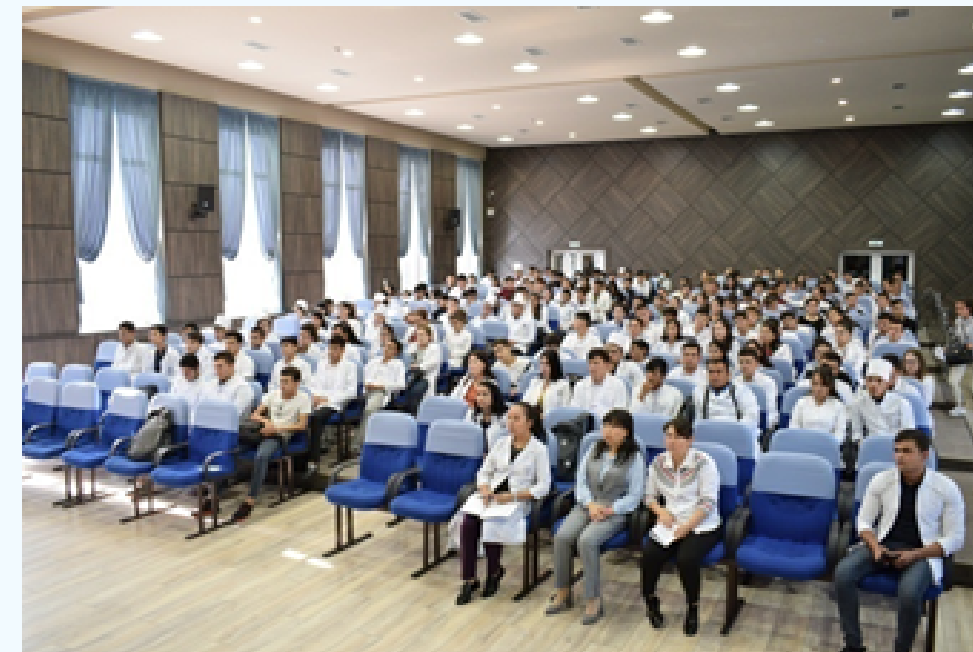
a meeting on the problem of migration with foreign students