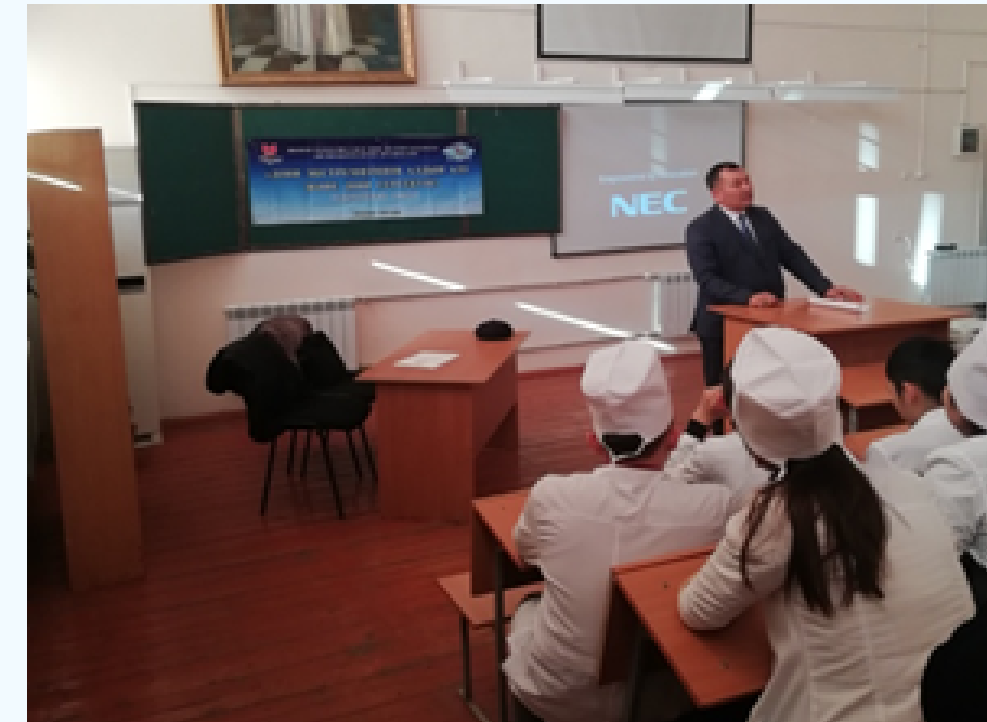
A meeting was held with representatives of the religious clergy