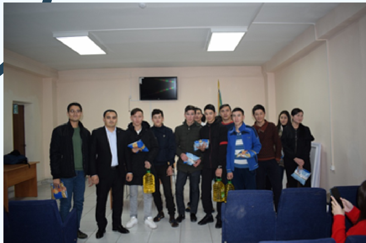
Dormitory students with the support of the student trade union organization are given food