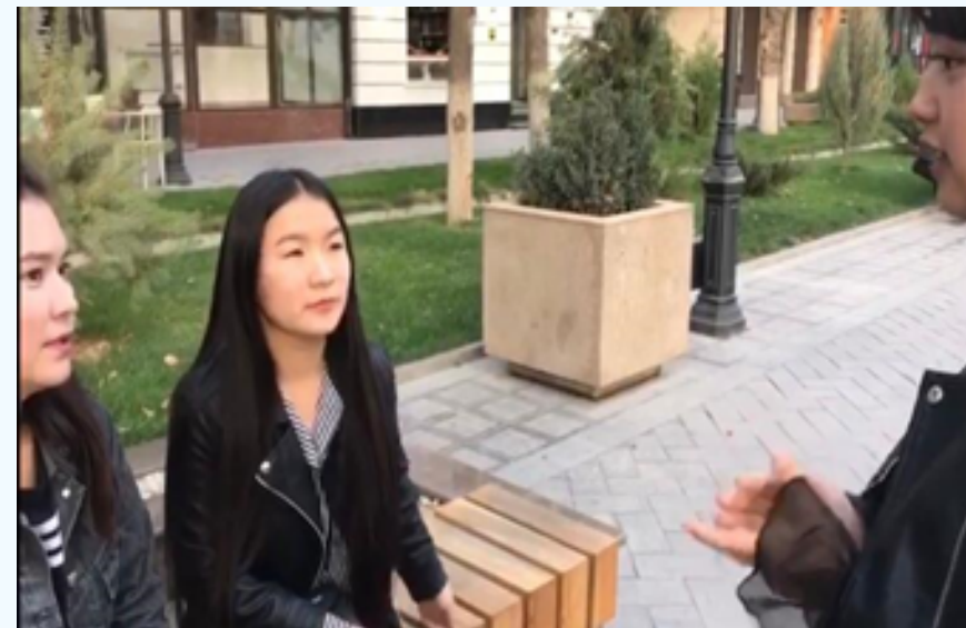
An experiment was carried out on the topic: "How young people know their history."