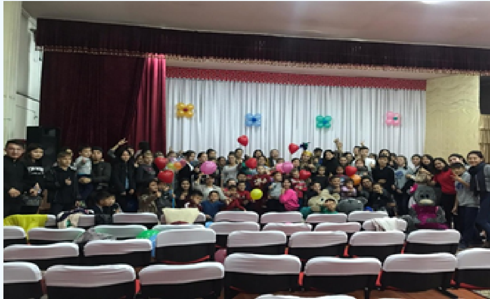
A charity concert was held at the orphanage number 4