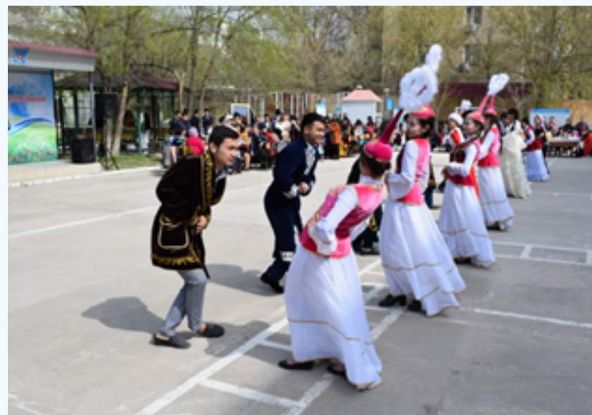
Popularization of our traditions. Nauryz holiday