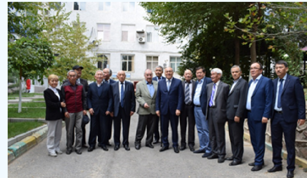
A festive table was laid for the "Veterans Day" for the veterans of the Academy