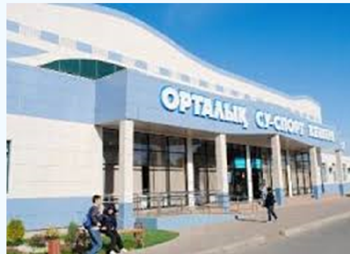
Subscriptions are issued to the central water sports complex