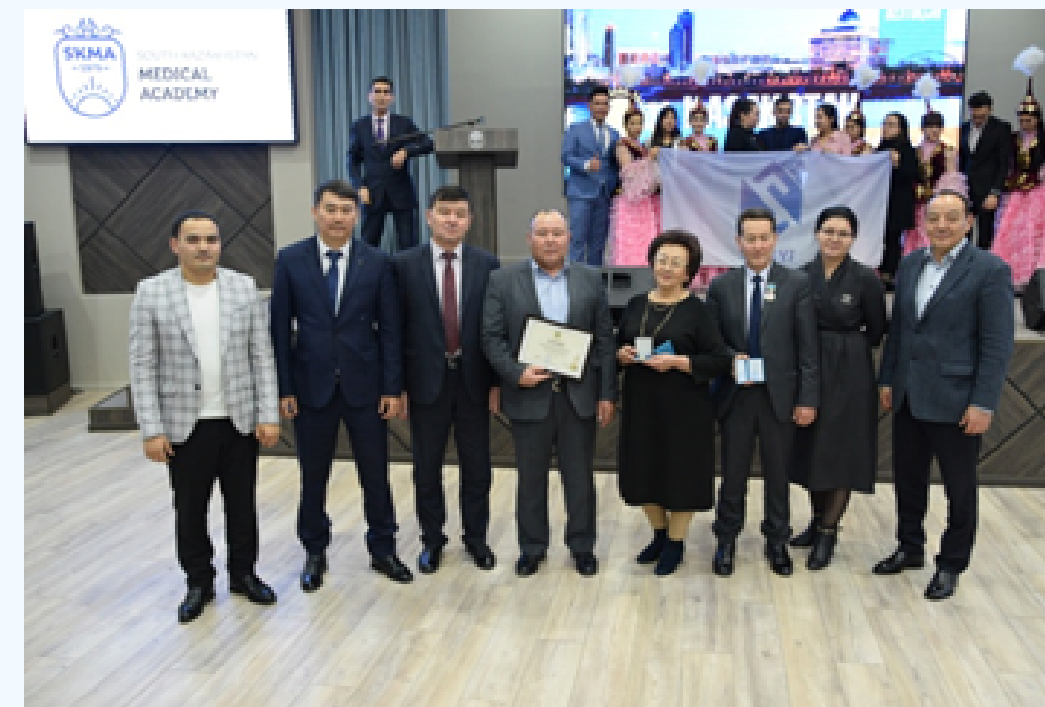
"December 16 - a solemn event was held on the occasion of the "Independence Day of the RK"