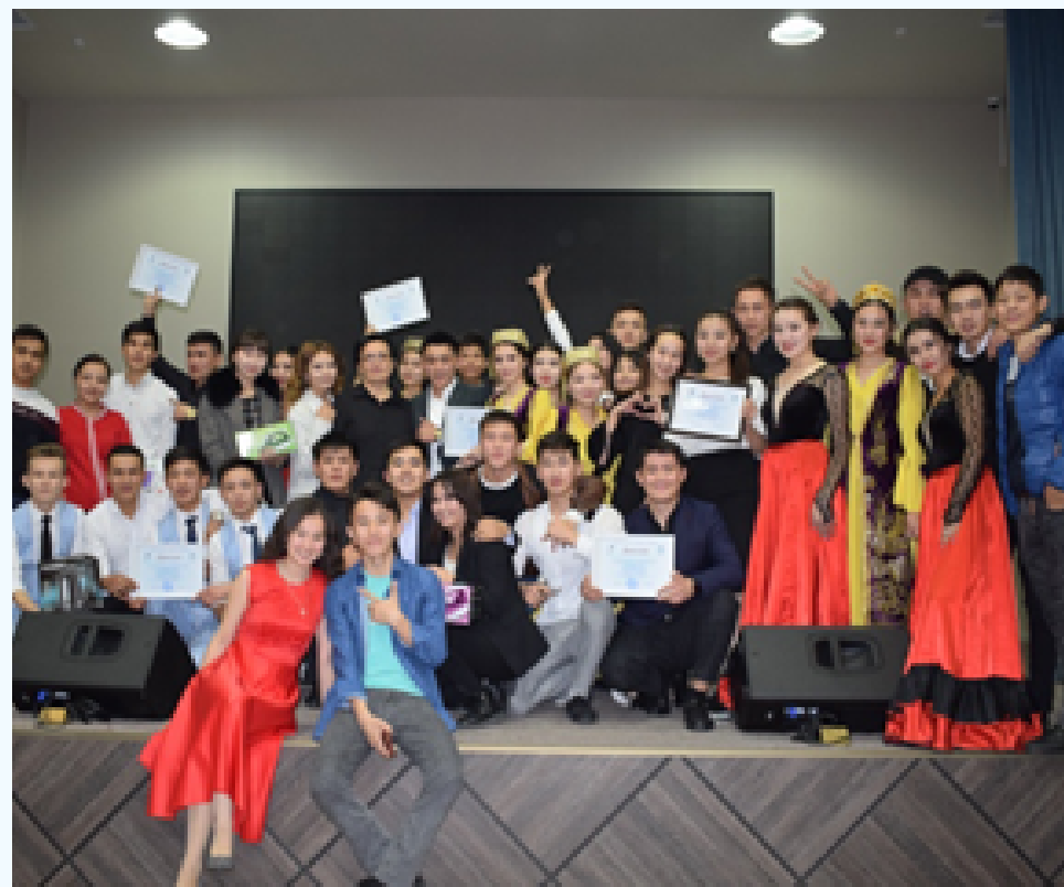
Interfaculty competition "New Wave"