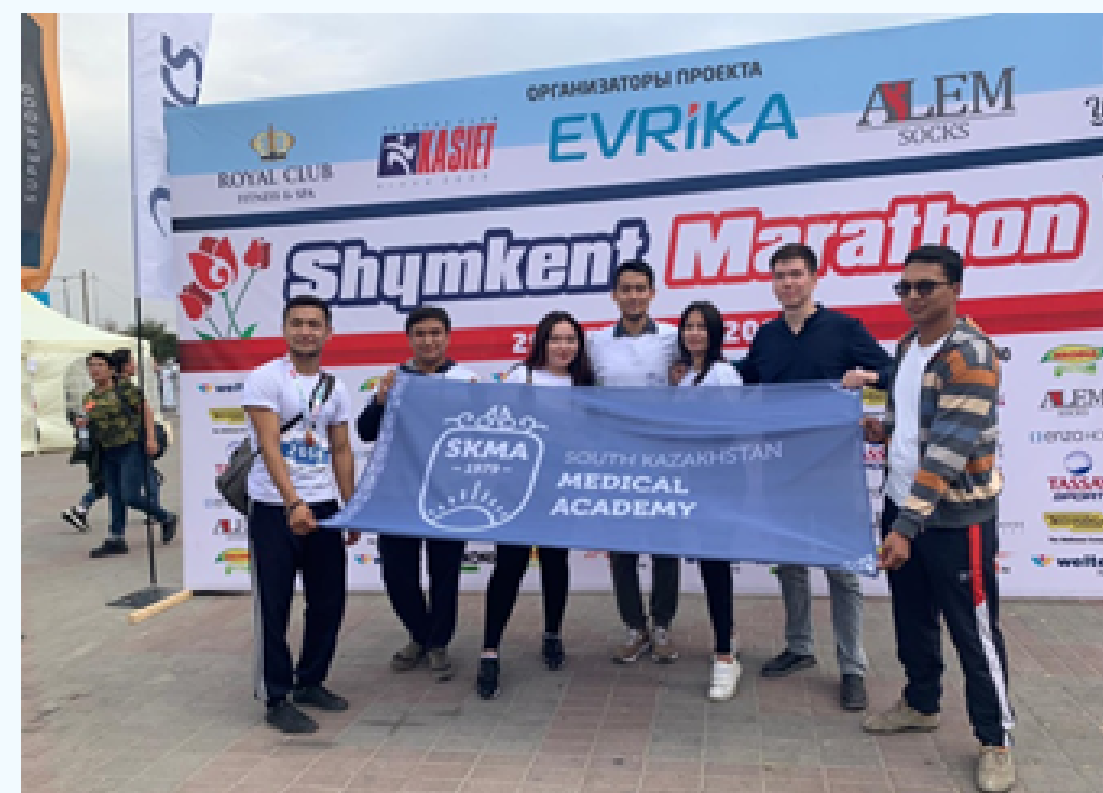
Academy students took part in the Shymkent city marathon as volunteers, and carried out organizational work