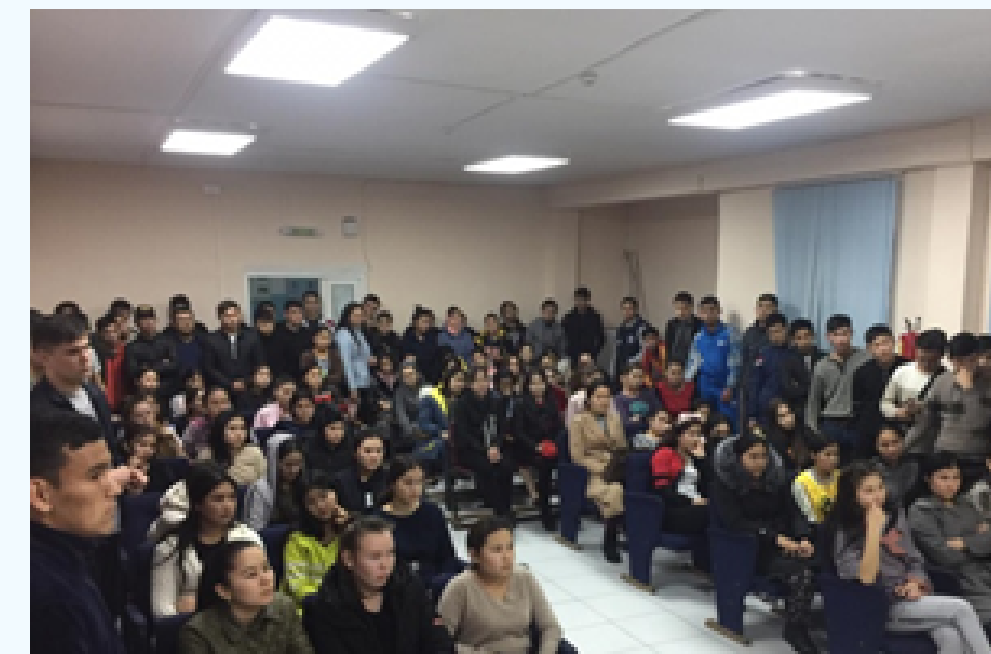
Meeting of dormitory students