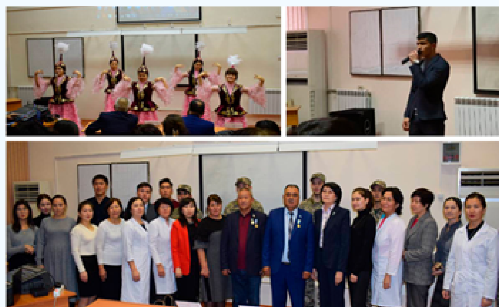
Event on the theme "Zheltoksan Yyzgary" a meeting with the heroes was held