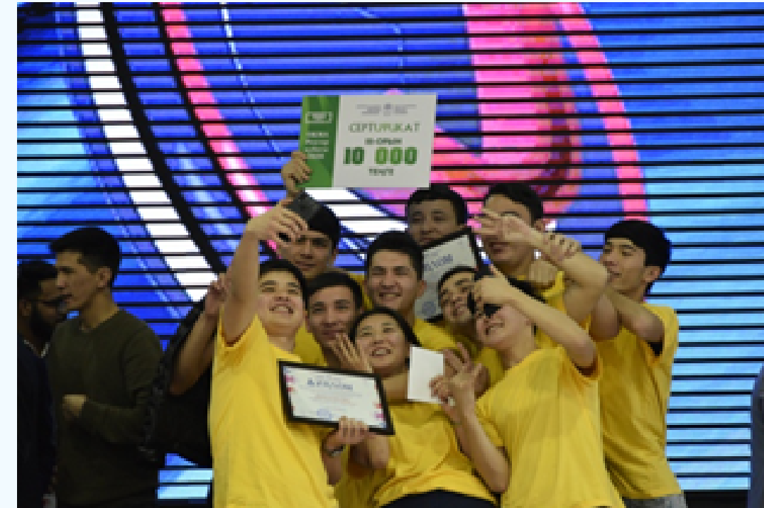
Foreign students at the Zhaidarman Games