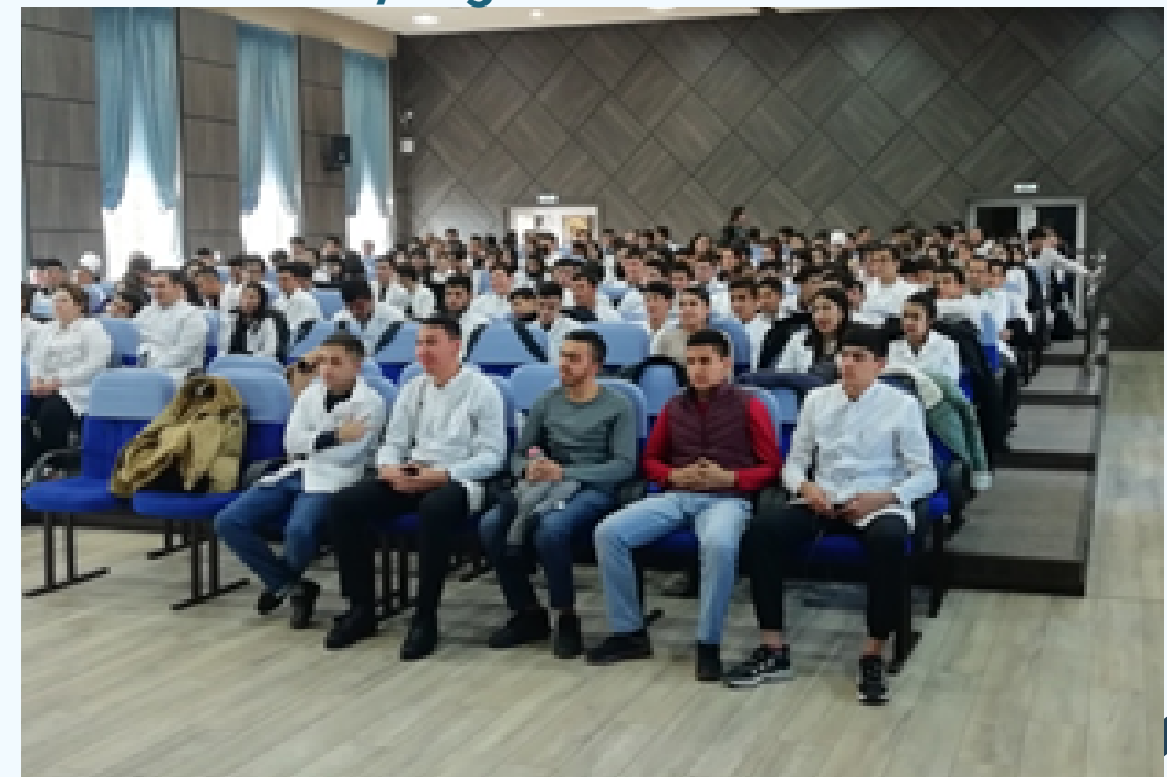
Meeting with representatives of other ethnic groups