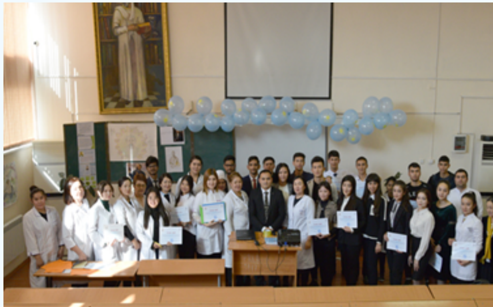
A literary evening was held on the theme "Darkhan khalyktyk dana Abayy"