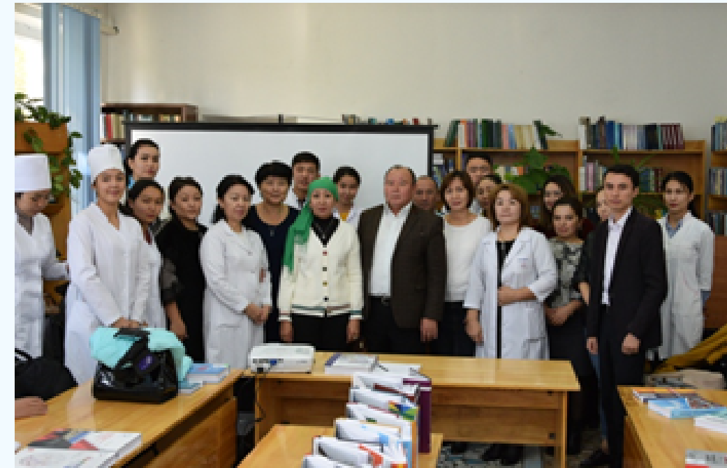
"New humanitarian education" Meeting on the project "100 new textbooks in the Kazakh language"