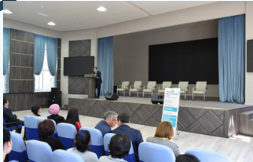
a meeting on the topic "Presidential Youth Personnel Reserve"