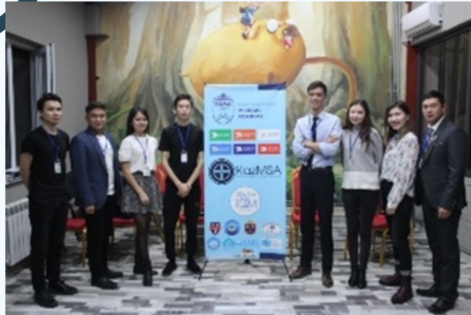
A winter meeting was held of the Association of Medical Students of Kazakhstan