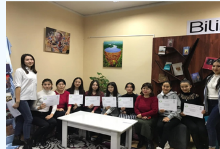
In the library of Abai "to the 175th anniversary of A. Kunanbayev" was held a memorial evening