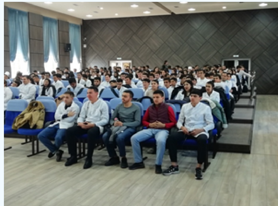
Meeting with foreign students