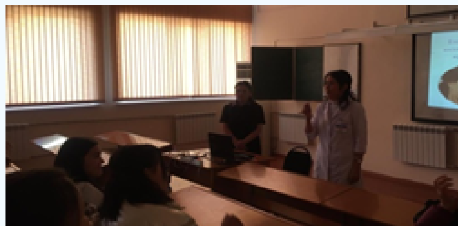
Conducted Sex Education Meeting