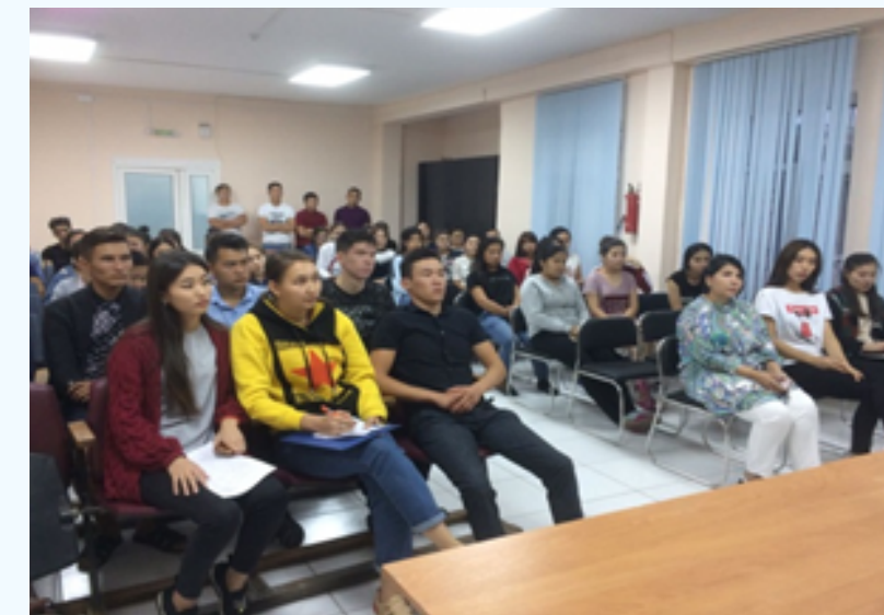
An introductory work was carried out for the students of the hostel with the rules of education and internal regulations