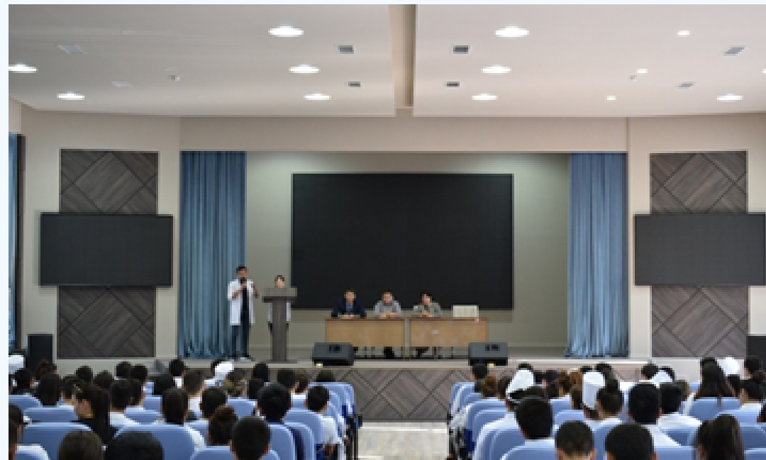
A meeting was held with foreign students on migration issues