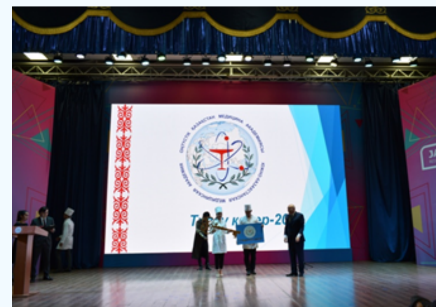
For 1st year students was held "Dedication 2019"