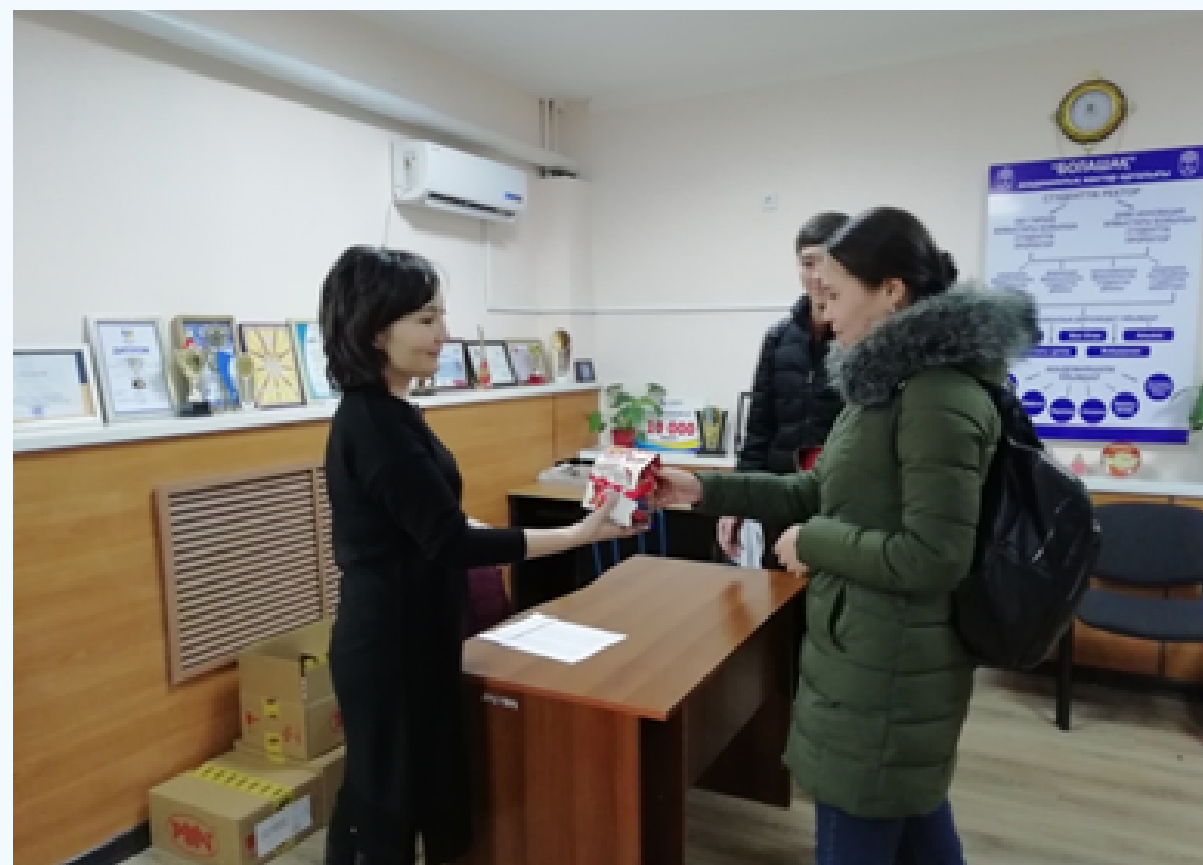
New Year's gifts were given to low-income students