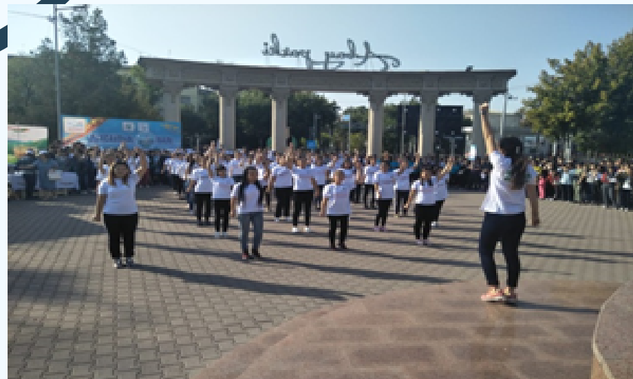
Festival of health held. Abay park