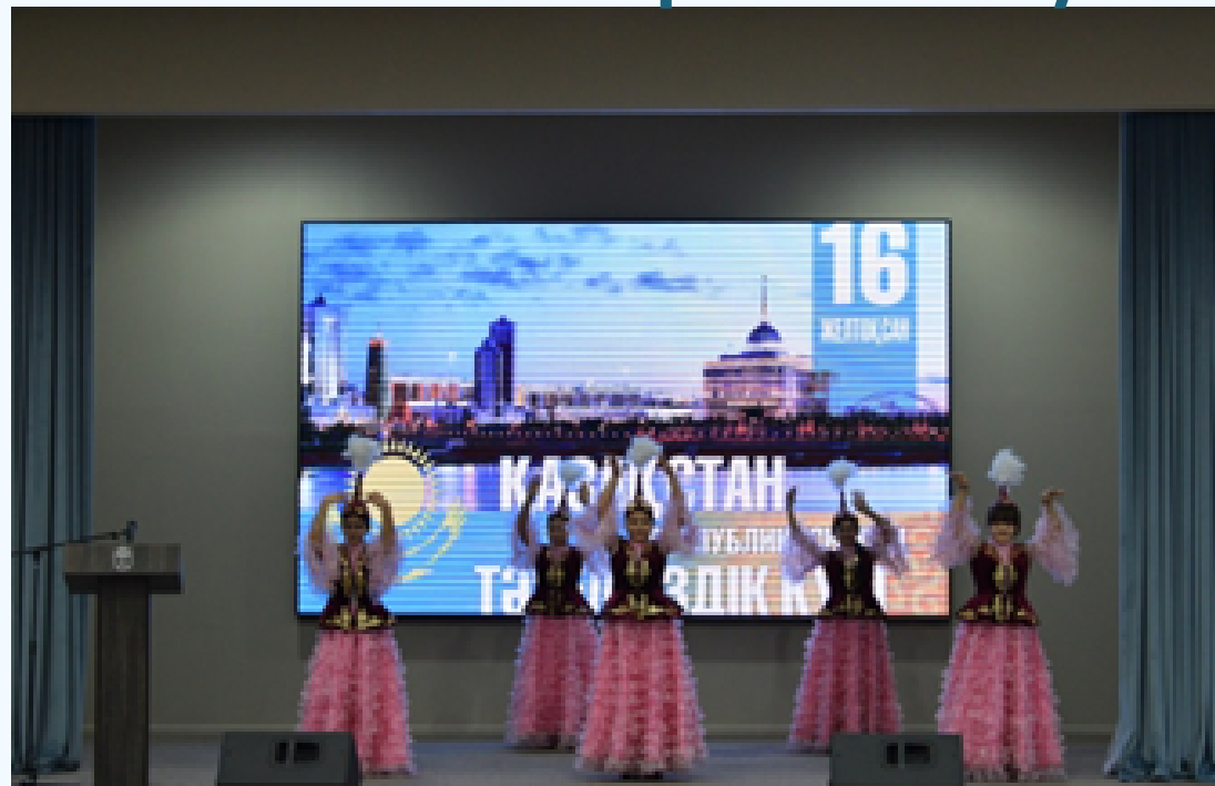
Participation of the friendly organization "Birlesu" in the events